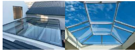
Staircase window – Fixed glass