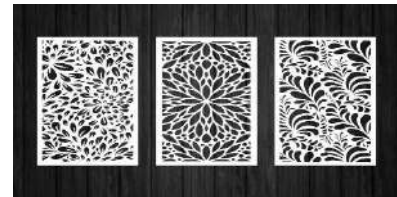
Designer gate with Shera boards