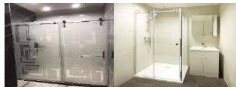
Designer glass for modular works