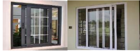
UPVC Open able window